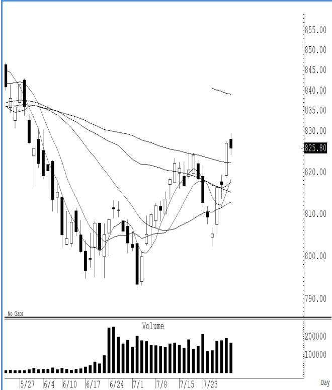
S50U24 (Close 825.80 Chg -1.20)